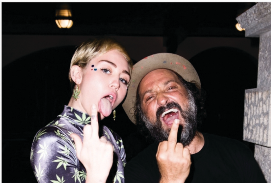
Miley Cyrus with Mr. Brainwash at Haute Living Hublot event